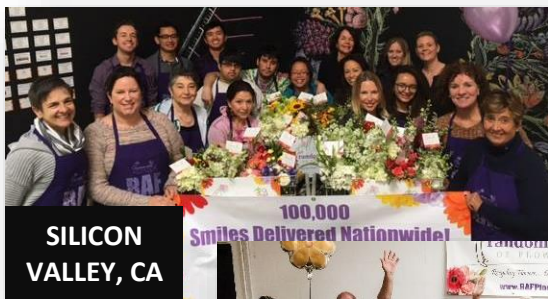
SILICON VALLEY, CA

On the same day, Random Acts of Flowers also celebrated its 100,000 th floral delivery nationwide – a major landmark for the organization! Celebrations and special deliveries were made at each of the RAF locations (Knoxville, Tampa Bay, Chicago & Silicon Valley).