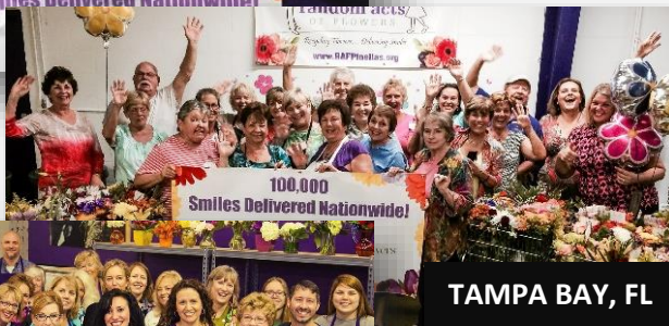
TAMPA BAY, FL