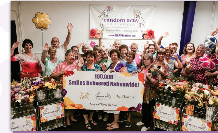
RAF Tampa Bay celebrates the 100,000th delivery!

Since the founding of Random Acts of Flowers in July 2008, the mission has remained simple and focused; to deliver a moment of kindness and compassion to a person in a healthcare facility. Yes, the actual delivery of a bouquet of flowers is what's "front and center," but the RAF mission is so much more. We believe that the quality of our community's emotional and physical health can be improved one smile at a time. Medical studies have proven what we have all known – that a person's emotional state often correlates to their physical wellbeing. Happiness and healthiness go hand-in-hand and Random Acts of Flowers is proud to be a part of building better, healthier communities.