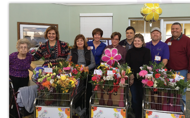
Volunteers and staff delivering the 25,000th RAF Tampa Bay bouquet

The growth of our branch is possible with the support of many. Due to limited space in the workshop, it was necessary to redesign the work space. A generous donor, Jeff Stern, was instrumental in creating the new look. With his gift we were able to install a new garage door, purchase six new work tables, paint, and improve the space and work flow for the volunteers. Another donor assisted in purchasing new lighting for the back room. Our next project is to build out and redesign the "cold room" through a potential community grant. The improvements to the space allowing more volunteers will help us reach our goal of 16,000 "happy customers" in 2016. ■