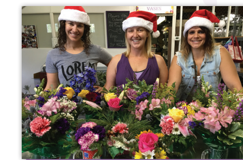
Volunteers creating holiday joy!

were delivered to the VA hospital at Bay Pines. The volunteers also created 350 Christmas mugs that had been donated throughout the year just waiting to be distributed with beautiful holiday flowers. It was a joyous day for 700 residents in our long term care centers